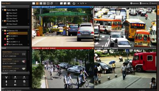
Software editions of NVR 3

Both standalone and software versions applicable.