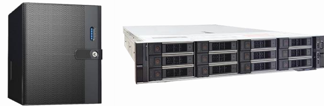
Standalone NVR options based on NVR 3.