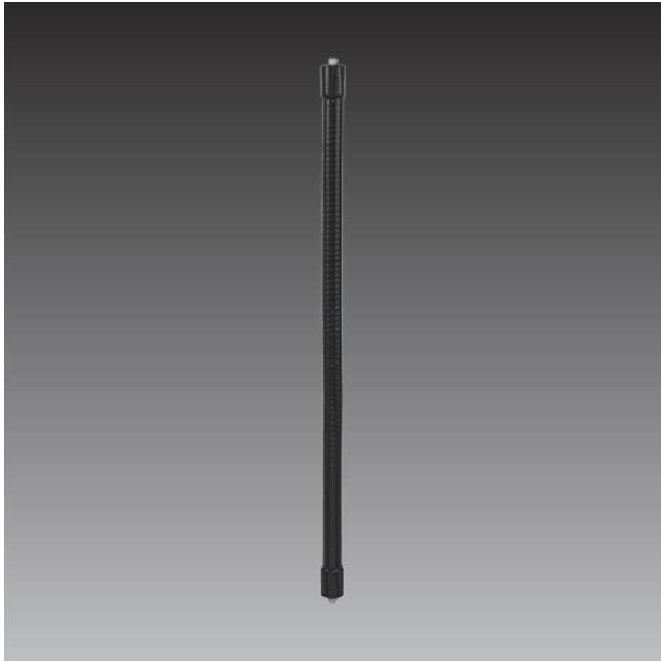
Gooseneck Bracket for Micro Box Cameras