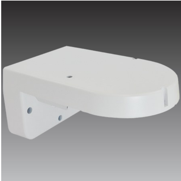
L-Type Wall Mount (for I91, I92, KCM-8111)